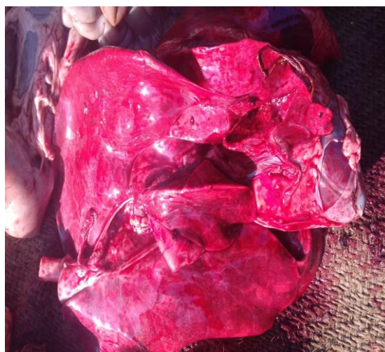
Fig-2 Lungs (Highly congested)