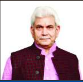
Shri Manoj Sinha Hon'ble Lieutenant Governor UT of J&K